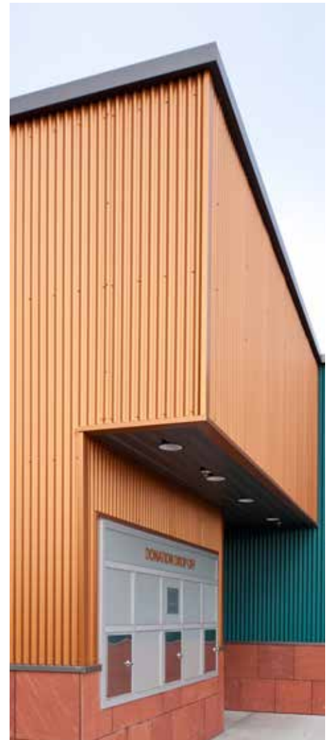
Silicon Valley Animal Center, Milpitas, CA

Additional product information is available from the manufacturer upon request. Metal Sales Manufacturing Corporation product information may be found in McGraw-Hill Sweets, ARCAT.