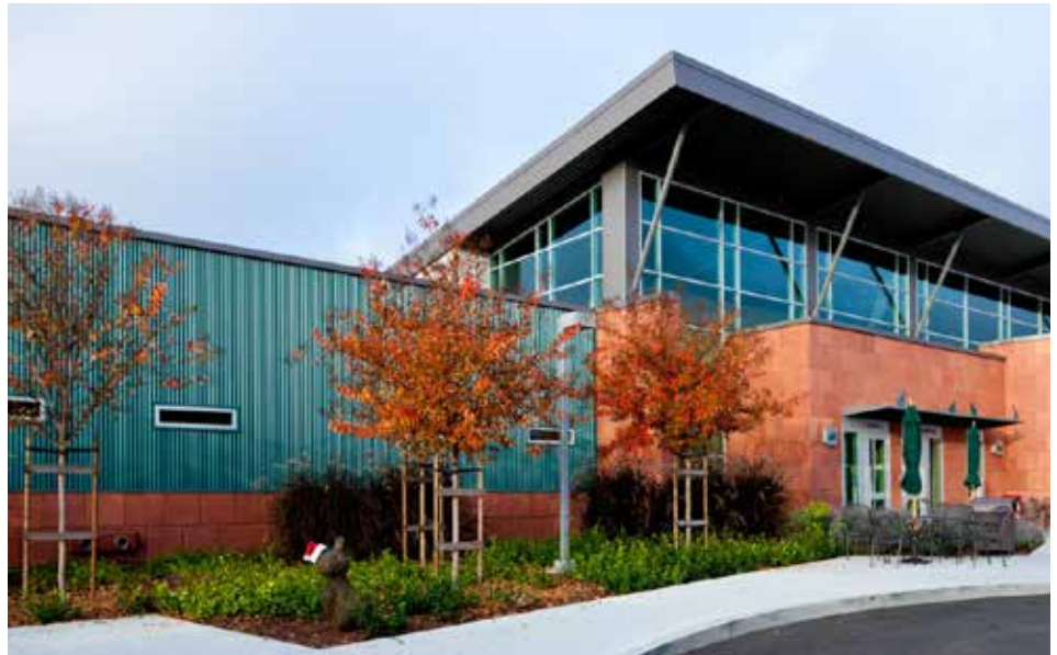
Silicon Valley Animal Center, Milpitas, CA