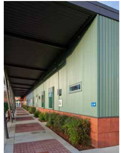
Silicon Valley Animal Center, Milpitas, CA